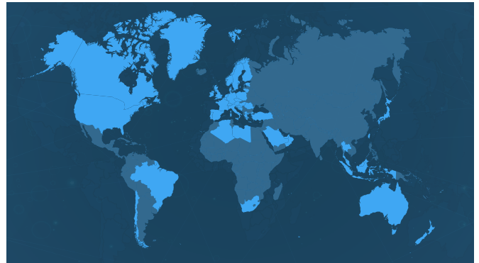
Map displaying the 50+ IRIS customer nations worldwide

Keeping standards information updated in relation to the set rules and agreed standards are essential in ensuring cooperation in military systems between countries and coalitions. IRIS Standards Management enables you to import standards data from other nations and standards organisations and collectively revise standards information and rules, facilitating interoperability and collaboration.