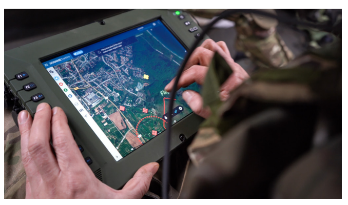
Mounted commander using SitaWare Frontline's sketching tools

Using the SitaWare Tactical Communication (STC) protocol, SitaWare Frontline enables clear communication and effortless data transmission in challenging conditions, improving the speed of manouvre for the mounted commander.