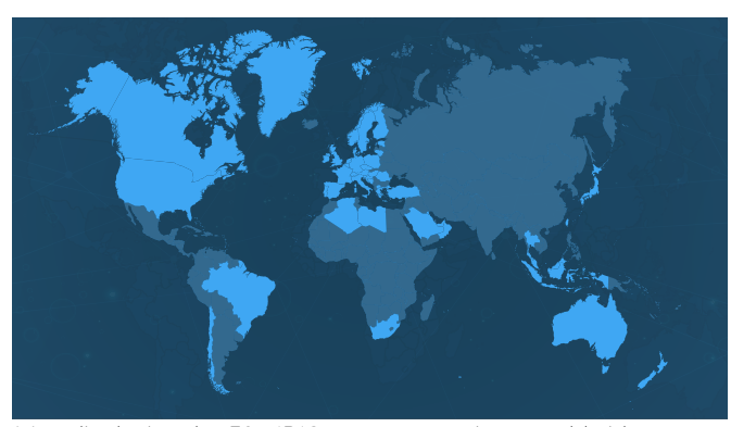
Map displaying the 50+ IRIS customer nations worldwide

Keeping standards information updated in relation to the set rules and agreed standards are essential in ensuring cooperation in military systems between countries and coalitions. IRIS Standards Management enables you to import standards data from other nations and standards organisations and collectively revise standards information and rules, facilitating interoperability and collaboration.